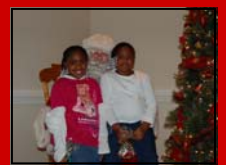
Everyone enjoyed Santa's company